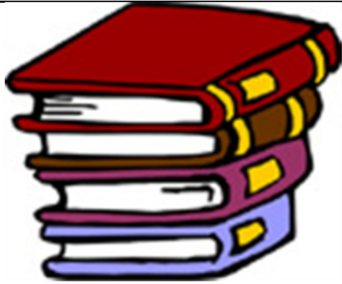
Linguistic Intelligence or Word Smart

This type of intelligence relates to your ability to use words and language both in writing and when speaking. People who are highly skilled in writing, have an extensive vocabulary and/or speak several languages are strong in this intelligence.